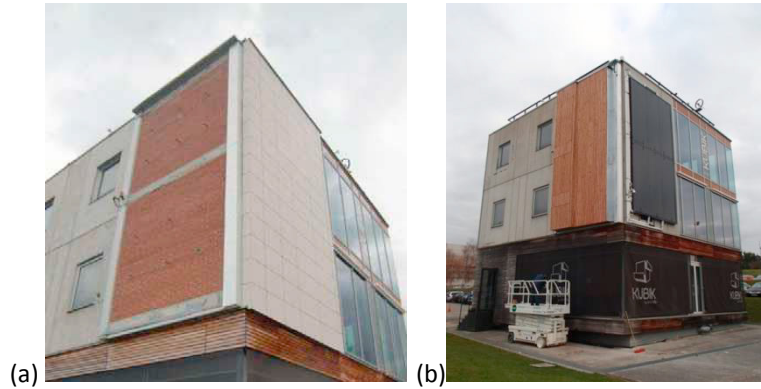
Fig. 2. Test area at first floor of west-facing façade in KUBIK facility: (a) original brick wall before installation; (b) BERTIM prototype installed.